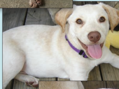
Sky, after getting treatment.