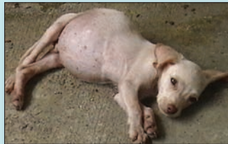
Sky, rescued from certain death.